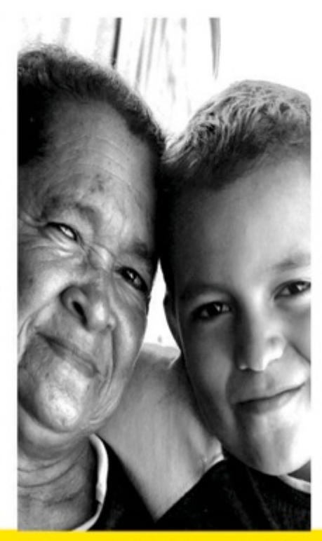
Post-conflict & Territorial Development