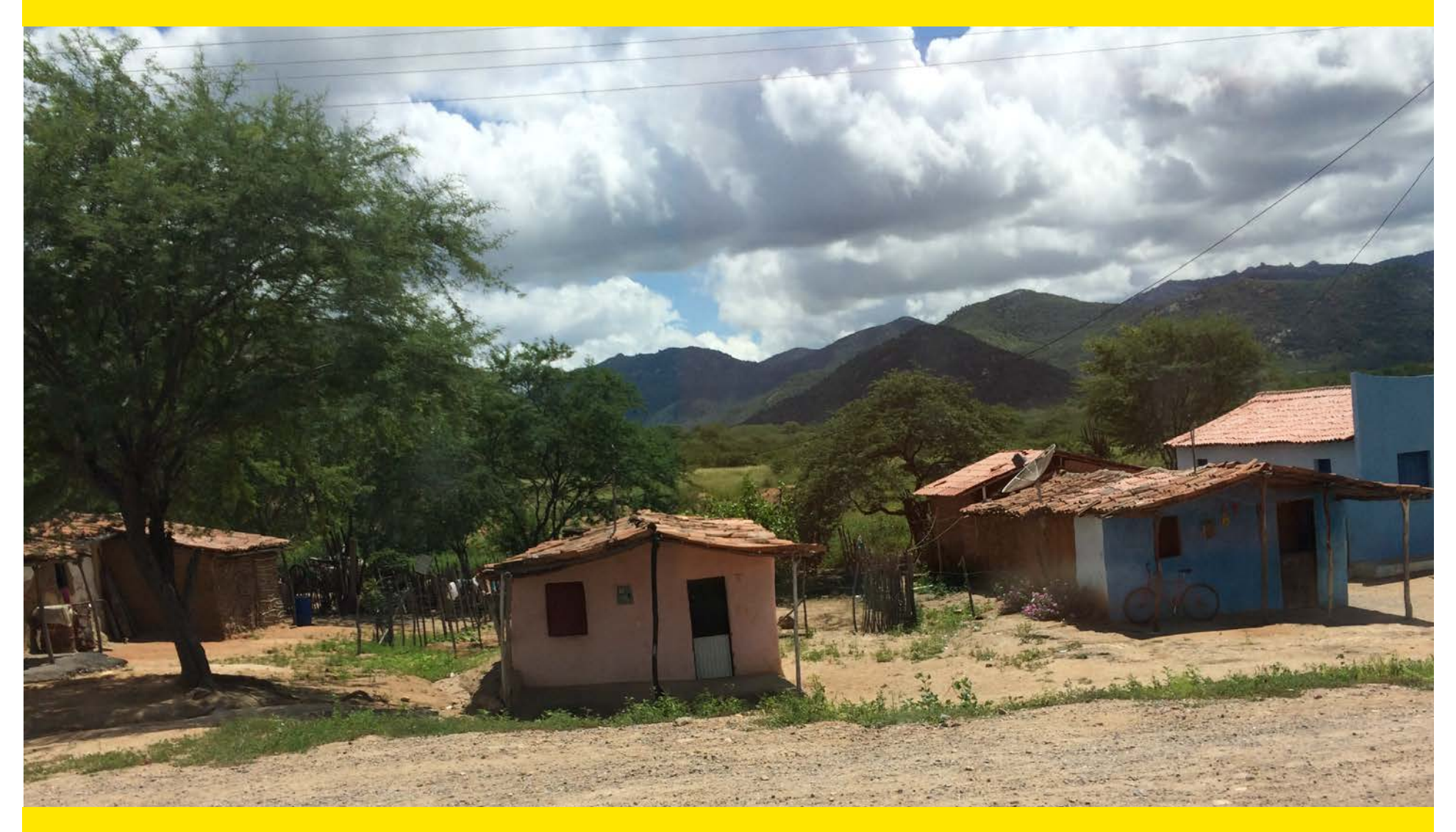
Under design. Expected to start implementation in November 2015